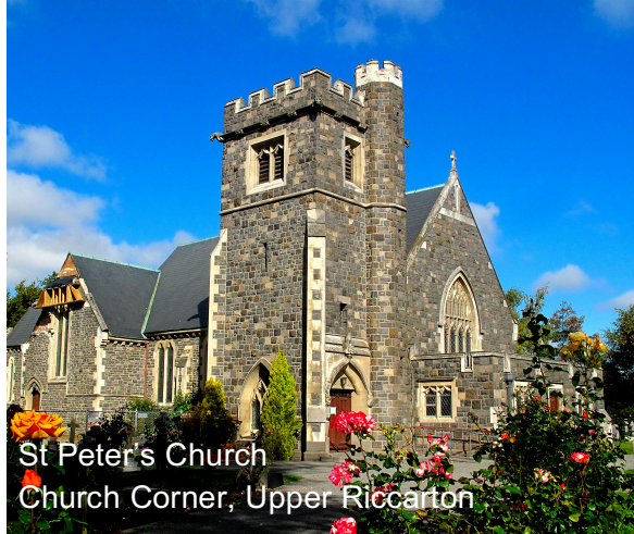
St Peter's Church Church Corner, Upper Riccarton