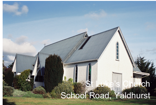
St Luke's Church School Road, Yaldhurst