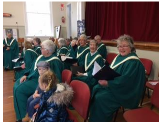
ST PETER'S CHURCH CHOIR