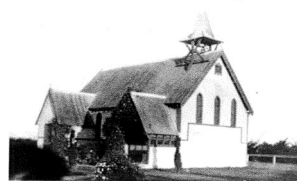
St. Luke's Church

Family Service 28 October 11 am Bowden Hall