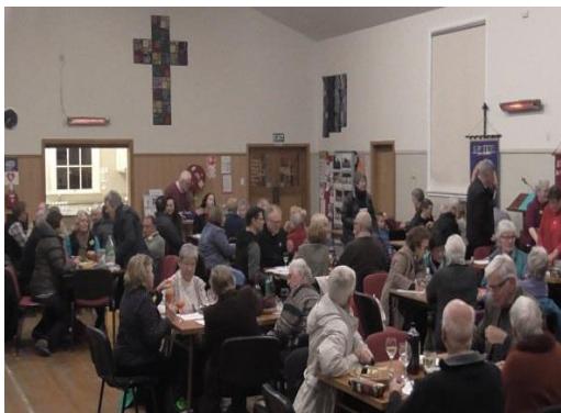
Groups all ready to go!