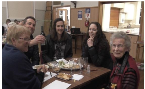
Family time – its all for the fun of it.