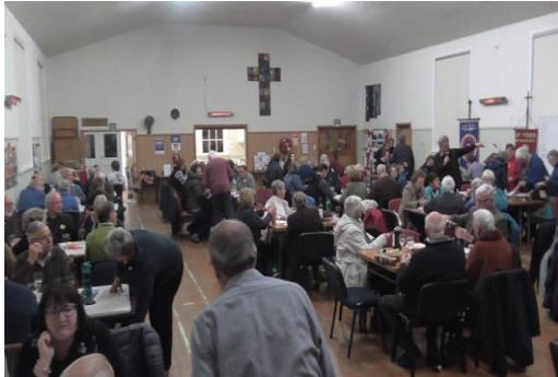
21 Competing tables

The Quiz night was a success. Alongside much enjoyment, a total of $1,500 was raised for the church restoration fund.