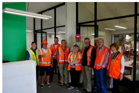
Onsite Visit by Vestry & Projects Manager