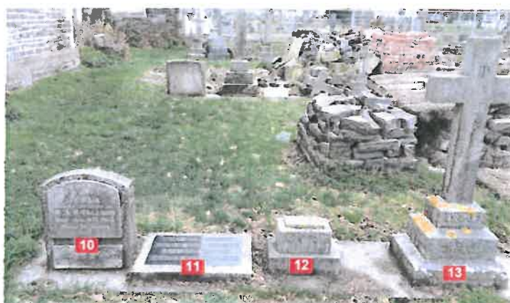
Gravestones 10, 11, 12 & 13 located north of the church.

Jessie beloved daughter of W and R Falloon DOD January 4 1913 Aged 17 years