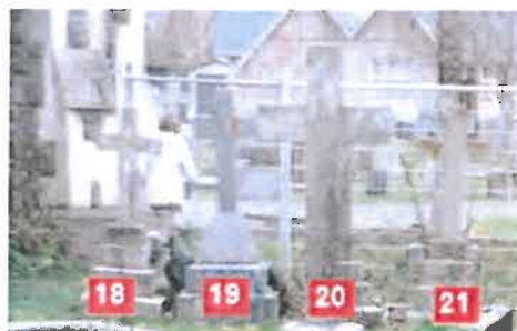
Gravestones 18, 19, 20 & 21 located north of the church. No legible photos have been taken of Gravestone 22 (plaque).

The remains detected in the Geotechnics ground survey (gravesite N1 at 0.9m deep) are likely to be those of Gravestone 14. The new building will cantilever over this gravesite and the gravestone will be relocated as close as possible to the remains. Refer to site plan (appendix) for relocated position and foundation schematic (appendix).