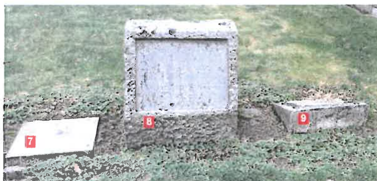
Gravestones 7, 8 & 9 located south of the church.