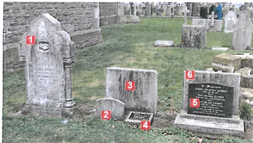
Gravestones 1, 2, 3, 4, 5 & 6 located south of the church.

These 22 gravestones are proposed to be relocated (some temporarily) to allow for the new extensions to St Peter's Church. The following document records the condition and information visible on the gravestones. It is to be read in conjunction with the Proposed Part Site Plan (Appendix 16) for the proposed relocation positions, and the GPR Report (Appendix 13) for the proximate relationship to the detected human remains.