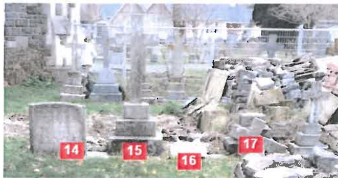
Gravestones 14, 15, 16 & 17 located north of the church.

No photos have been taken of gravestones 14-17.