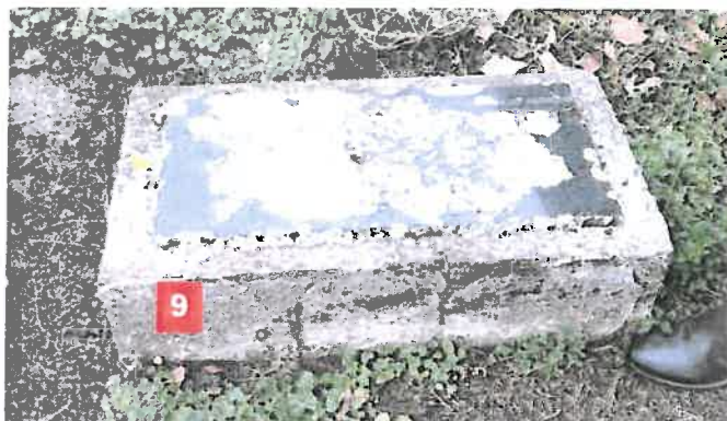
Gravestone 9: Details illegible. Refer to site plan for relocated position.

Also their daughter Susann Clarkson 26 September 1960