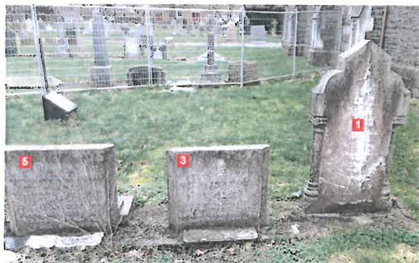
Gravestones 1, 3, & 5 (other side of headstones) located south of the church.