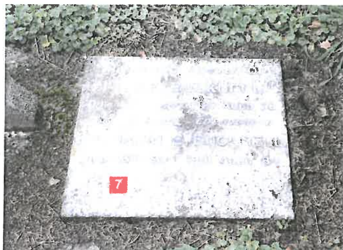
Gravestone 7: Lizzie Bucknell, 1927 and Benjamin Bucknell, 1951. Gravestone 7 is to be temporarily relocated during construction works and then reinstated at the same location post-construction.

Lizzie Bucknell DOD 30 September 1927 aged 56 and her beloved husband Benjamin B Bucknell DOD 13 September 1951 aged 84