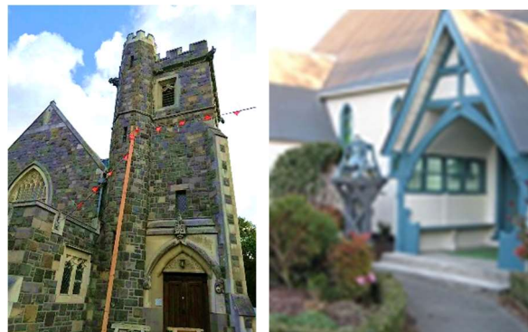
St. Peter's & St. Luke's Church