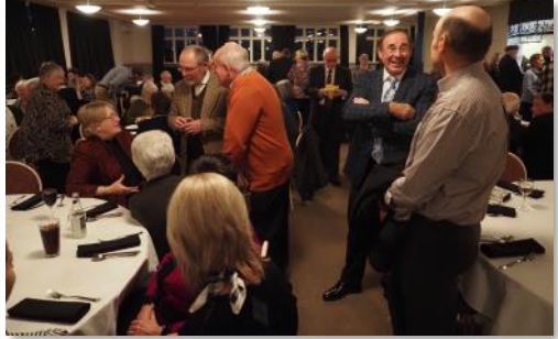
Good food, good company, good times!