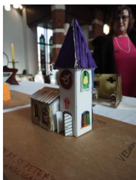
Two church models...