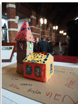
...from the preschool.