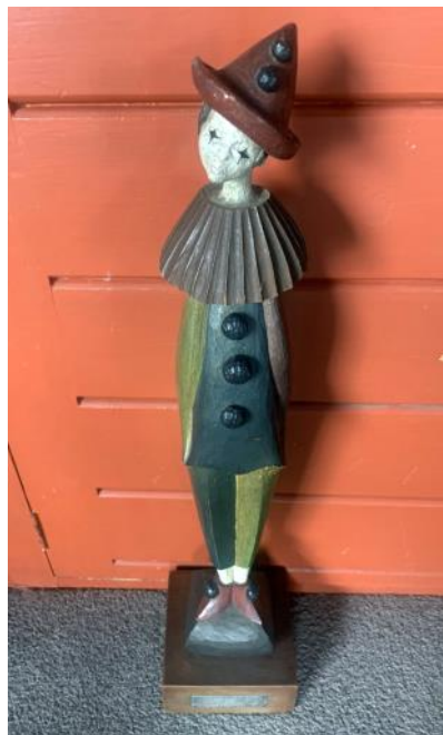
Sir James Hay Memorial Trophy

A s in the last few years, our group had an entry in Theatrefest recently. This is a national one-act play competition that this year attracted 52 entries from throughout the country. At the local level, staged in the Rangirua Theatre, our entry 'Last Respects' achieved a number of awards, including two for excellence in acting, best production of a NZ play, and then the ultimate - Best Overall Production, the Sir James Hay Memorial Trophy. While we would most certainly have advanced to the regional and probably national finals, for various good reasons we had chosen not take our production further than the local level this time.