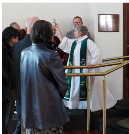
Nurse Maude representatives get wet!