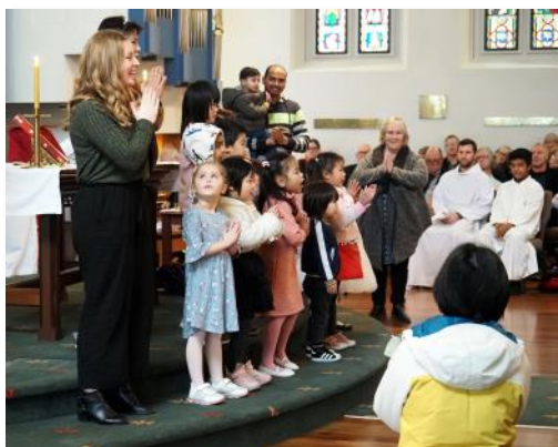
Preschool children sing The Lord's Prayer