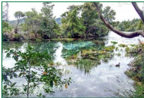
Te Waikoropupū (Pupu) Springs

“Like a spring of pure water, God’s peace in our hearts brings cleansing and refreshment to our minds and bodies.” ...Billy Graham