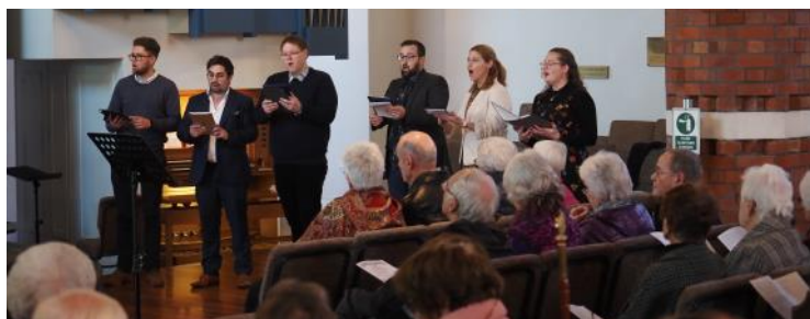
Half of "Conspiro" presenting Festal Evensong.