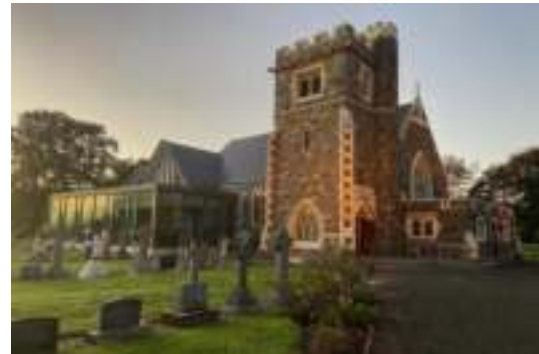
(St Peter's on Sunday at Sunrise in March 2023)

It is nearly 2 years now and it is wonderful to be part of this parish community, a part of the larger community of Upper Riccarton - Yaldhurst.