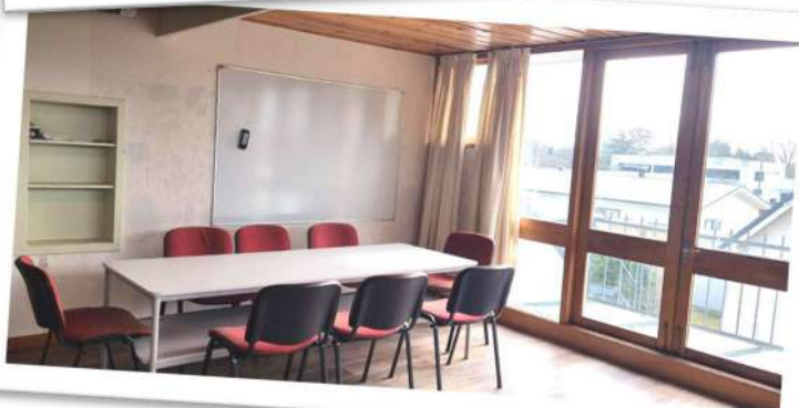
The upper room of the hall transformed by Victory!