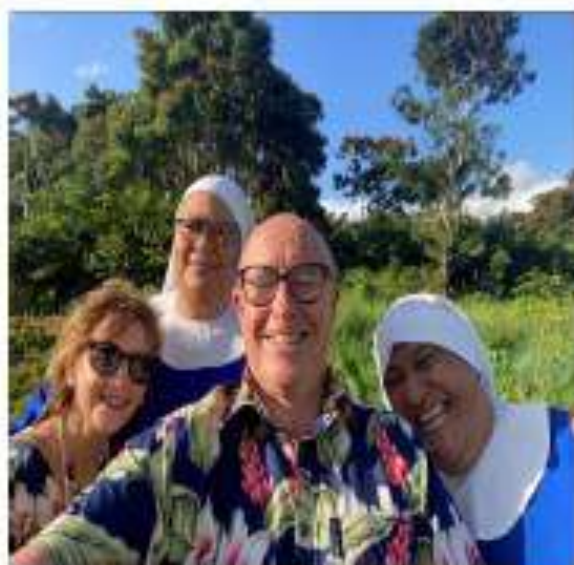
Golden Oldies leaders on their visit to Fiji.