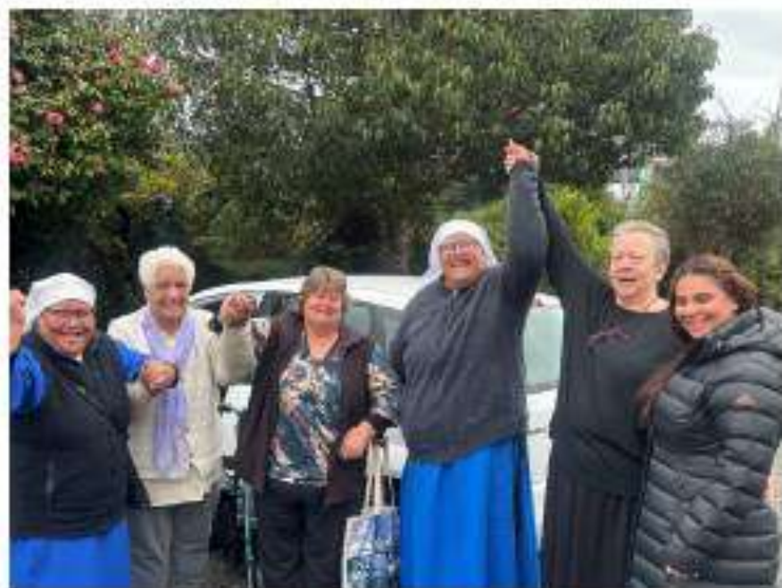
Visit to Hokitika